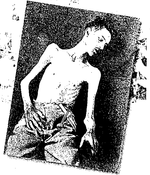
The terrible conditions at Civil War prison camps caused much suffering and death.

Around 50,000 men died in Civil War prison camps. But this number was dwarfed by the number of dead on the battlefronts and even more from disease in army camps. In the next section, you will read about the bloody battles that led to the end of the Civil War.